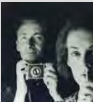
Albert TUCKER In the mirror: self-portrait with Joy Hester 1939

Albert Tucker (1914-1999) was one of Australia's most well-known and renowned artists, and a key exponent of Australian modernism. The Tucker Portraits explores how Tucker used photography within his practice - as source material as well as creating unique and intimate portraits that explored social, cultural and political life in Australia.