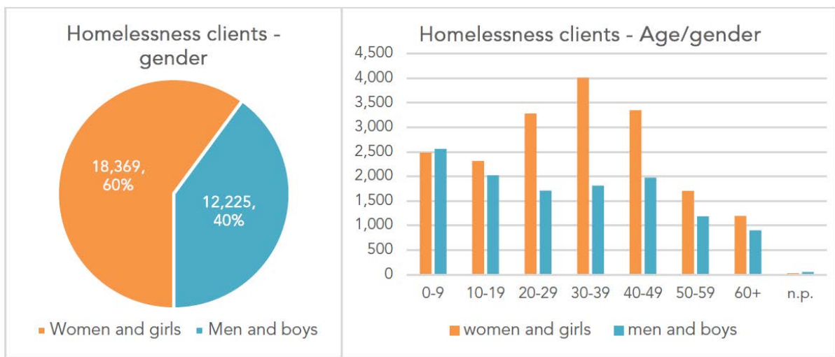
Table 1 AIHW Specialist Homelessness data 2017-2018 south and east region-wide.

Women and young children are the most over-represented homeless cohort across our region, however each local area demonstrates differences in how this homelessness manifests. This is largely due to the causal factor of family violence which is discussed in TOR 2. In 2017/18 women and girls represented 61 per cent of people accessing specialist housing support services. Homelessness is a gendered issue for all age groups in our region (except for children aged 0-9 years, who typically accompany their female parent to these services) as shown in Table 1.