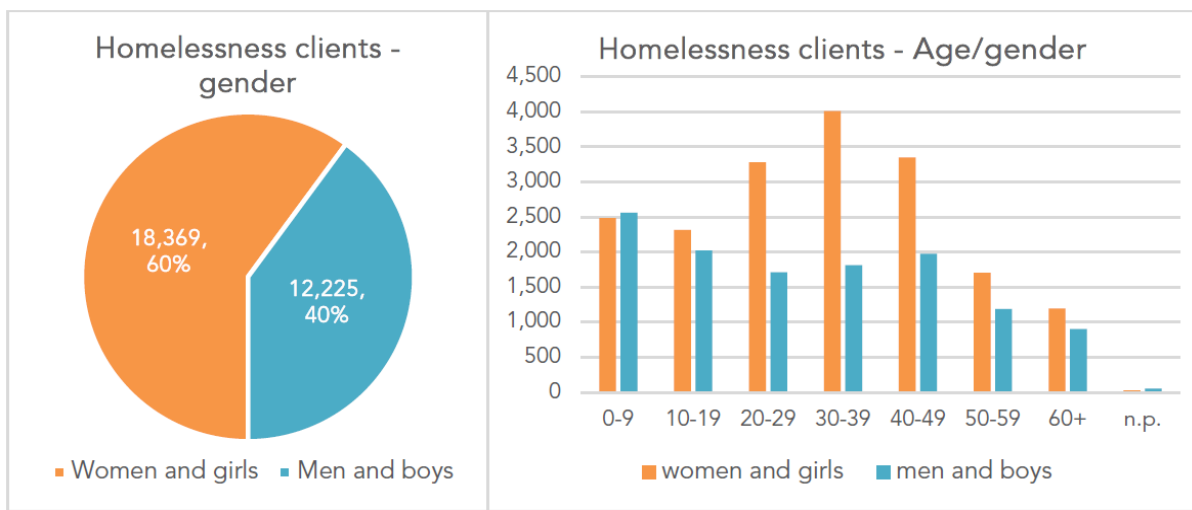
Table 1 AIHW Specialist Homelessness data 2017-2018 south and east region-wide.

Women and young children are the most over-represented homeless cohort across our region, however each local area demonstrates differences in how this homelessness manifests. This is largely due to the causal factor of family violence which is discussed in TOR 2. In 2017/18 women and girls represented 61 per cent of people accessing specialist housing support services. Homelessness is a gendered issue for all age groups in our region (except for children aged 0-9 years, who typically accompany their female parent to these services) as shown in Table 1.