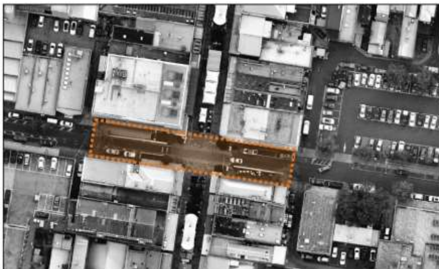
Area of Shared Zone Trial Proposal

This option involves the conversion of the street to a 20km/hr shared zone - 25 metres east and 33 metres west of Eaton Mall - which legally gives pedestrians the right to share the road space with vehicles. It would require new signage, the installation of traffic calming measures such as road cushions and linemarking and other interventions to signal a slow-speed pedestrian environment (e.g. planters, graphics on street, bollards, existing pedestrian signalised crossing being deactivated/covered). This option could be delivered as a lower-cost trial with a view to making more extensive pedestrian improvements in the future (e.g. raised pedestrian threshold treatments). Implementation of a shared zone would require DoT approval.