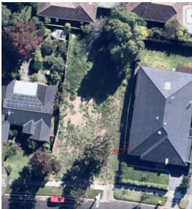
Aerial image of the review site with red arrow indicating tree to be removed. 2

The tree in question sits towards the front of the site, set back approximately 9 metres from the front boundary and 6 metres from the east boundary.