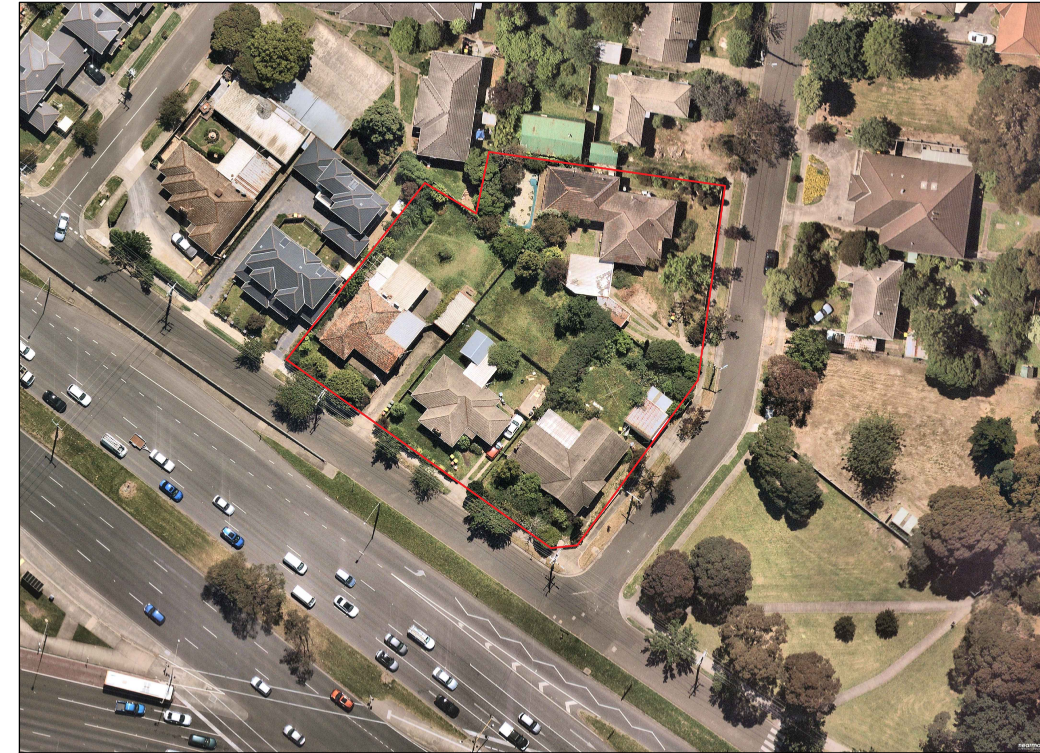
01 LOCATION PLAN (COPYRIGHT NEARMAP 2020) - NOT TO SCALE