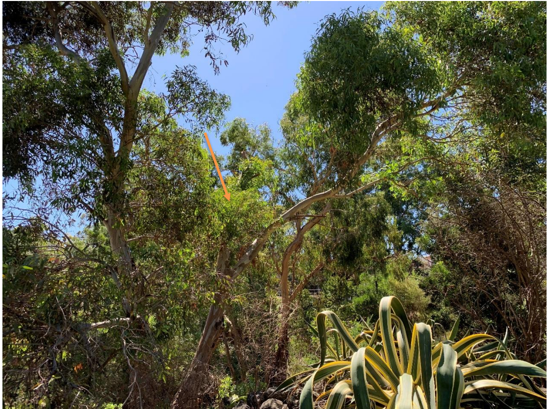
Tree 6 – the past stem failure is arrowed.