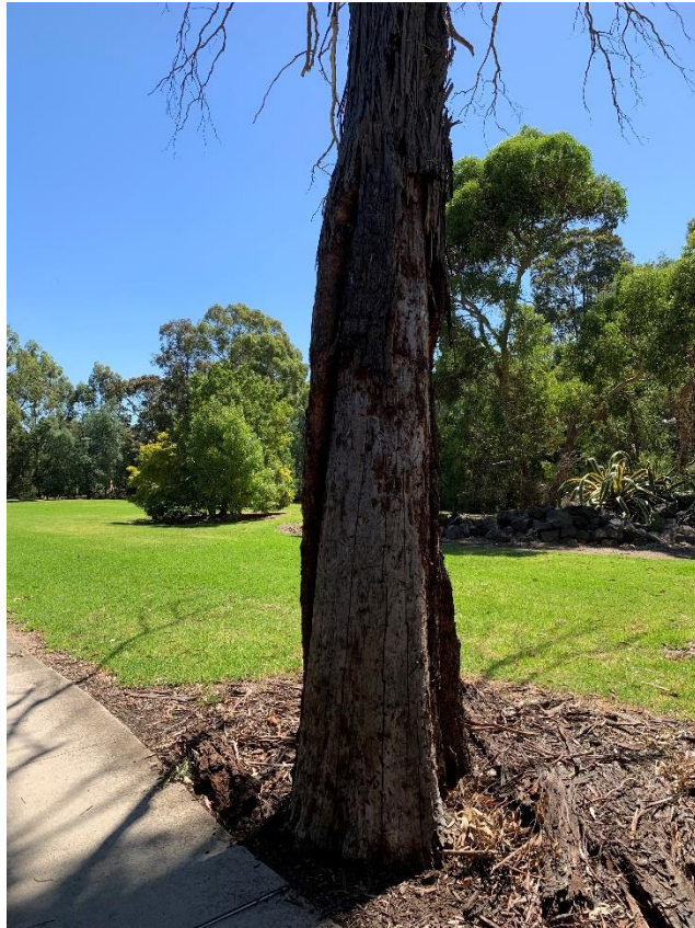
Trunk canker on Tree 5