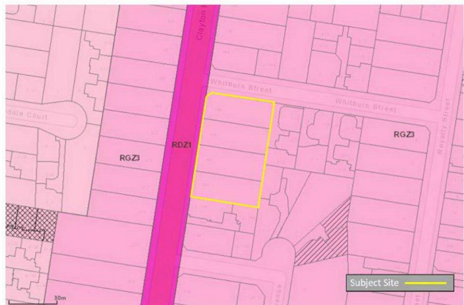
Figure 2: Zoning Map.