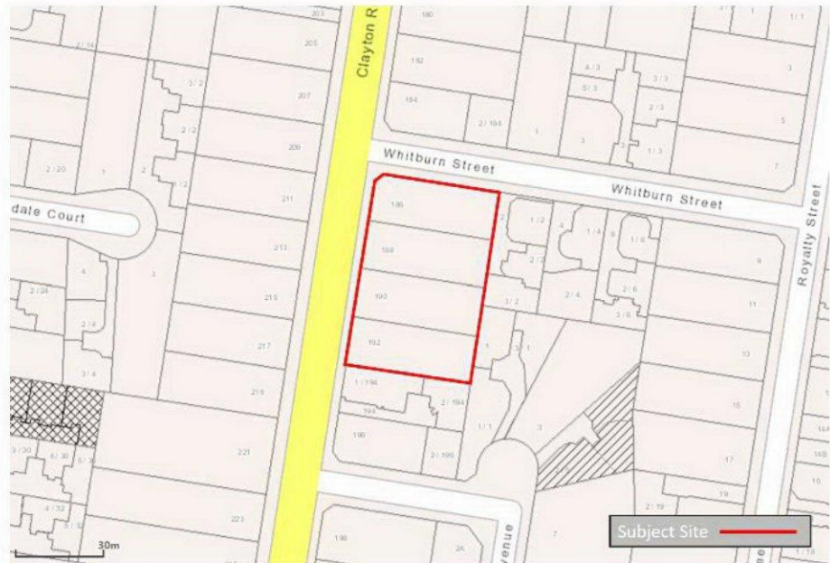
Figure 1: Cadastral Plan