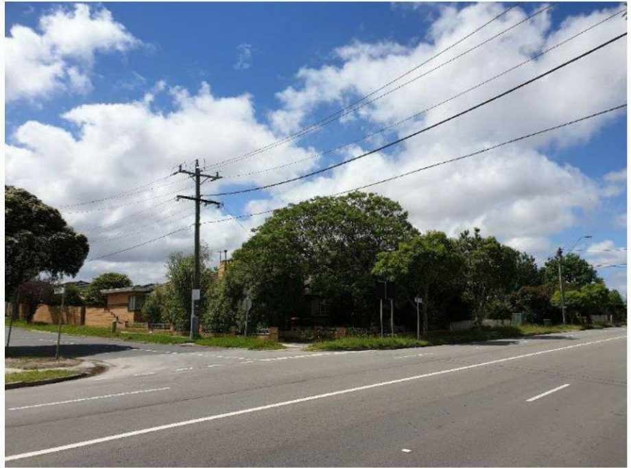
Figure 8: North of subject site viewed from Whitburn Street.