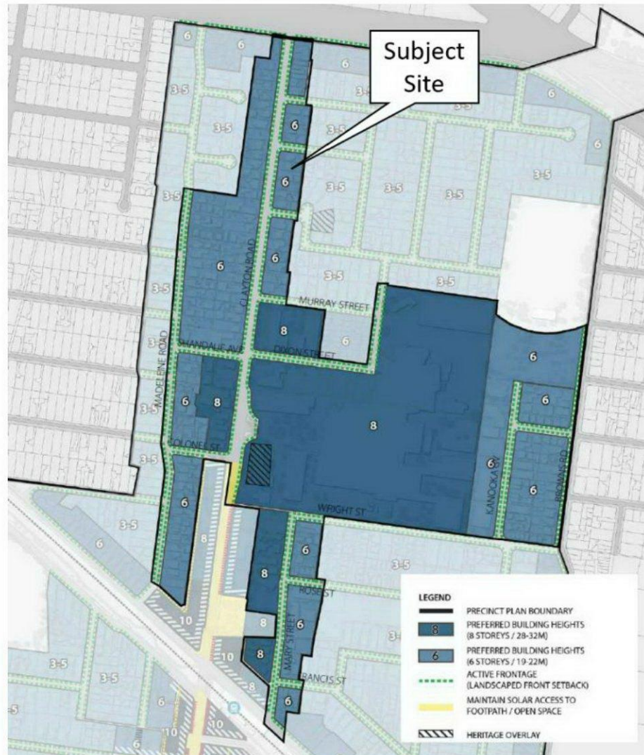
Figure 6: Preferred building heights for Precinct 2 Health and Medical.