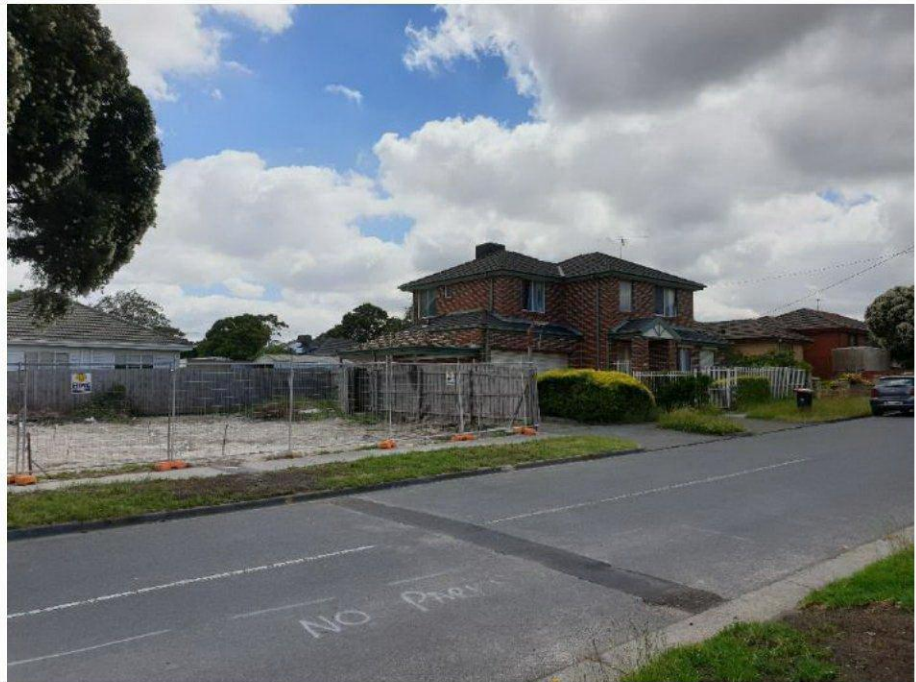
Figure 14: The adjoining property to the east, 1-3/2 Whitburn Street, developed with three single-storey townhouses.