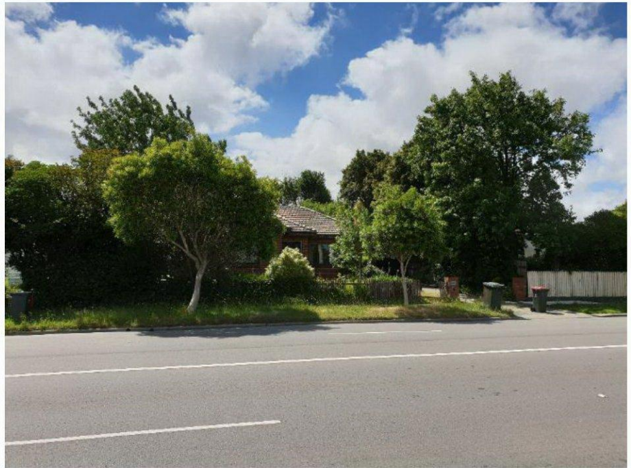
Figure 12: The adjoining property to the south, 1 and 2/194 Clayton Road.