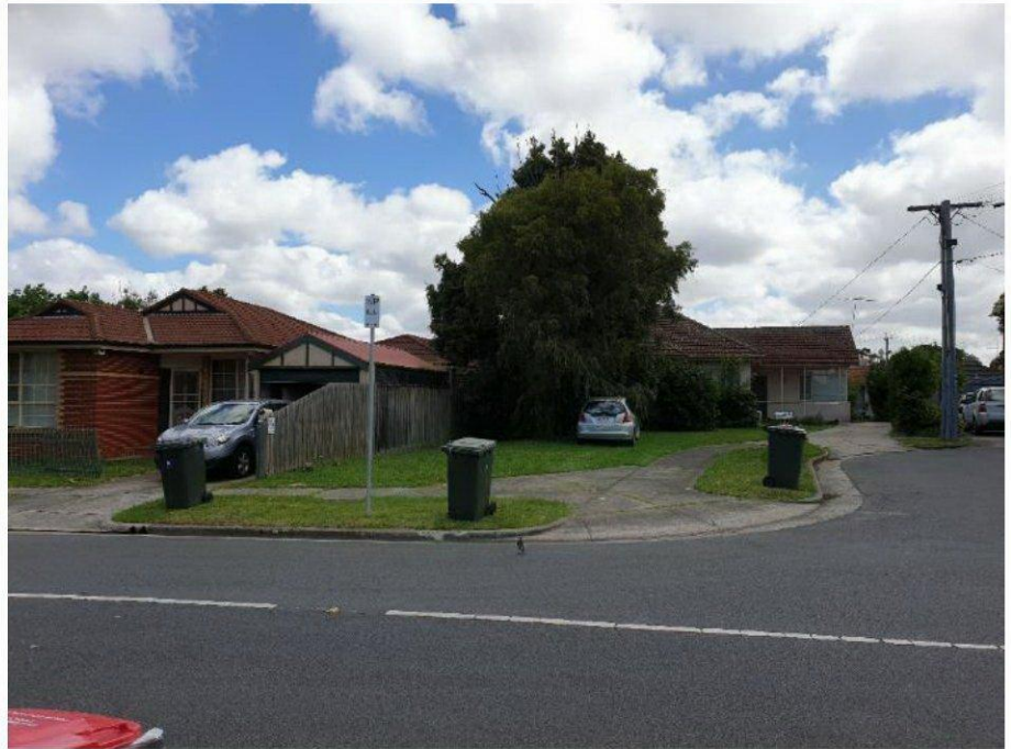
Figure 16: Whitburn Street looking west past the northern frontage of the subject site.