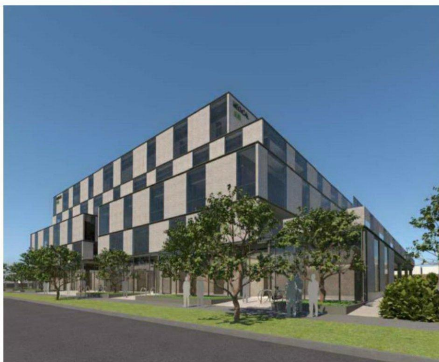
Figure 5: Render of development viewed from the south west.

Please refer to the application plans prepared by Hatz Architects for full details of the proposed development.