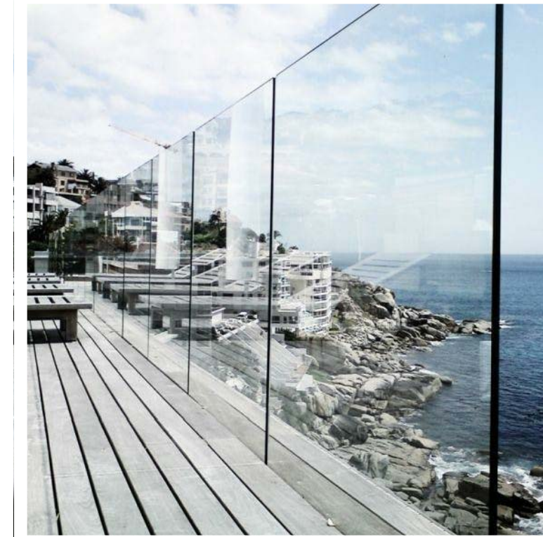
BA1 CLEAR GLASS BALUSTRADE