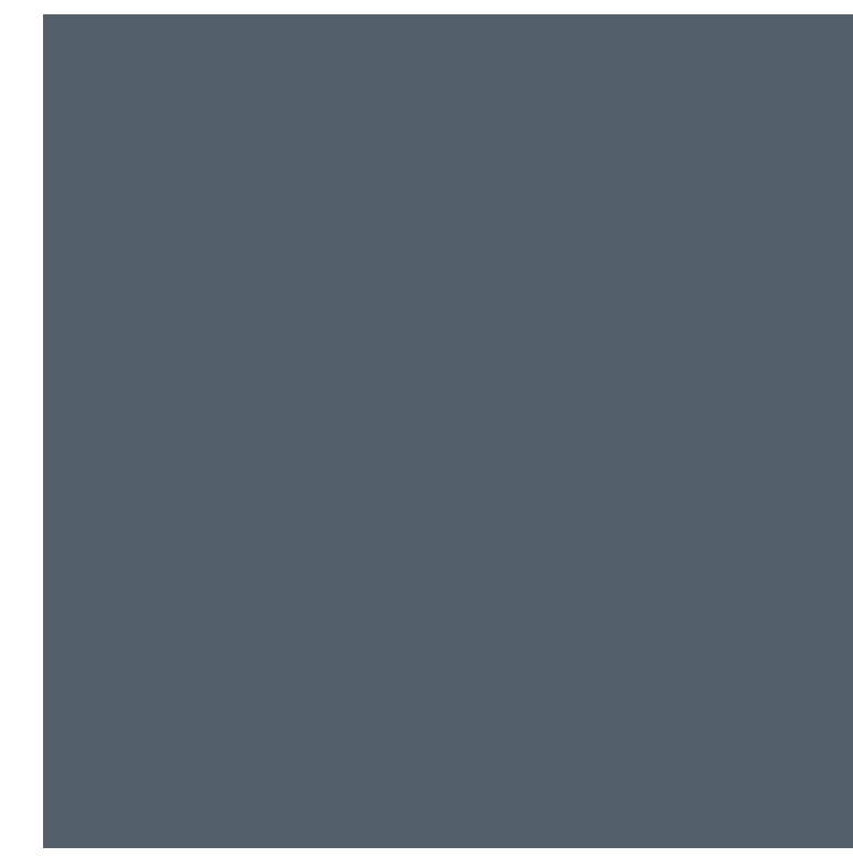
GL1 GLAZING. VIRIDIAN GLASS SOLAR TINT GREY WITH COLORBOND NIGHT SKY ALUMINIUM

Disclaimer: This drawing and design is subject to copyright and may not be reproduced without prior written consent. Contractor to verify all dimensions on site before commencing work. Report all discrepancies to Spowers prior to construction. Do not scale critical dimensions. Check this drawing has been printed to scale by measuring on the ruler below before measuring scaled dimensions.