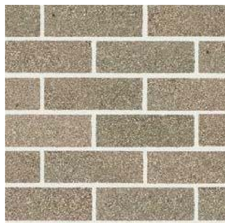
BK4 BOWRAL BRICK SIMMENTAL BRICK AUSTRAL