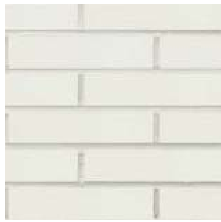
BK1 LA PALOMA MIRO AUSTRAL 230 X 110 X 76 MM