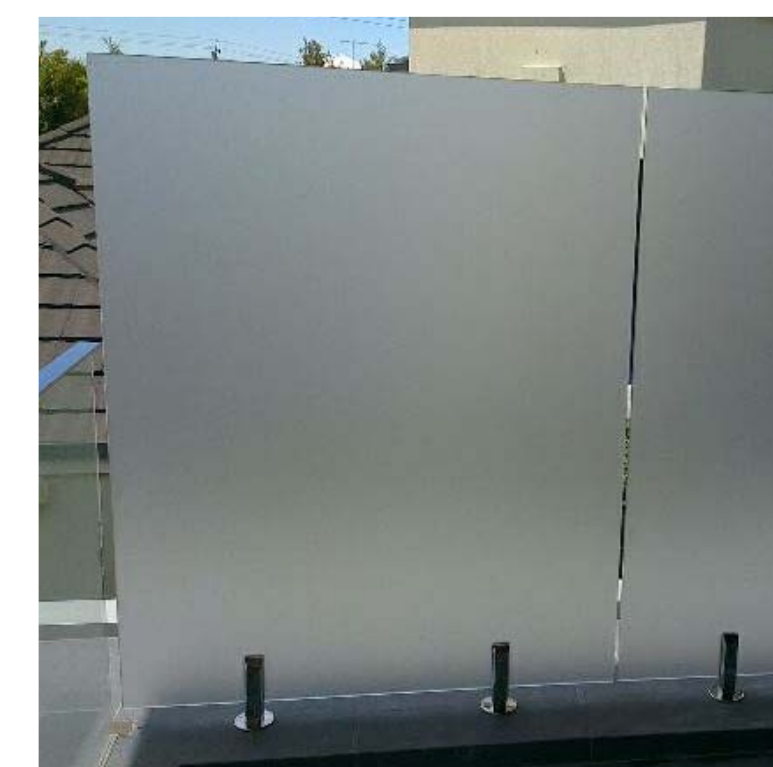
SF1 FROSTED GLASS SCREEN FENCE

Godfrey Spowers (Victoria) Pty Ltd 1/460 Collins Street Melbourne Victoria Australia 3000 T: +61 3 9614 6144 F: +61 3 9629 6791 info@spowers.com.au spowers.com.au