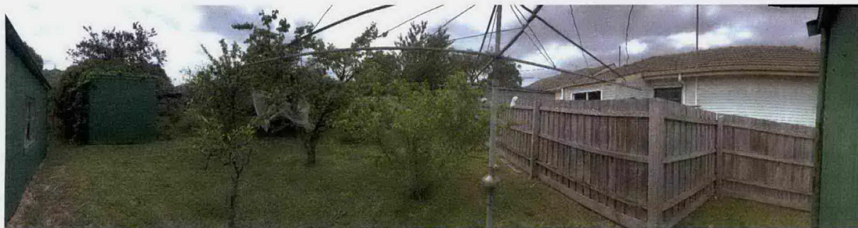
Image 6: Rear yard of 73 showing Tree 12 behind shed and other fruit trees not assessed.