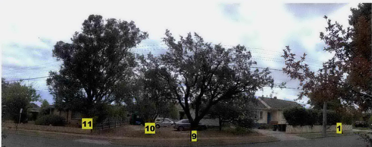
Image 2: Street frontage 23/10/2018, showing trees 11, 10, 9 & 1 (left – right).