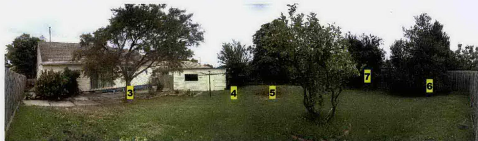
Image 5: Rear yard of 71, showing Trees 3 - 7. Lemon in foreground not surveyed, riddled with wasp gall.