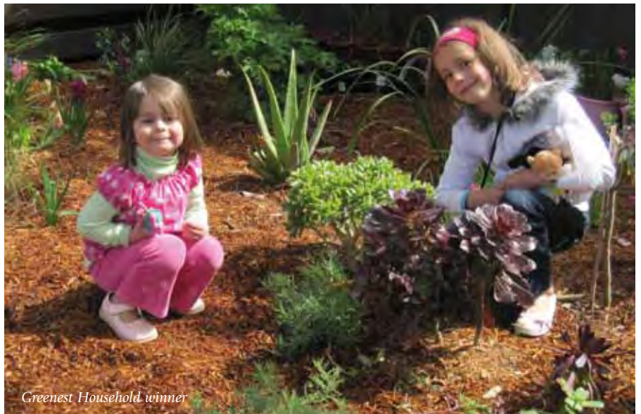
Greenest Household winner