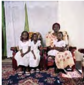
The 2010 Bowness winning entry

For more information, visit www.mga.org.au , email bowness@monash.vic.gov.au or phone 8544 0500. [m]